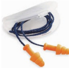
Reusable Ear Plug