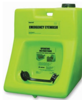
Portable Eye Wash