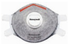
Disposable Respirators – With & Without Valve

A full range of Respiratory Protective Equipments like Disposable Respirators, Reusable Half Face & Full Face Respirators, Escape Masks, Powered Air Purifying Respirators (PAPR), Supplied Air Respirators & Self Contained Breathing Apparatus (SCBA)