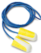
Corded Foam Ear Plug