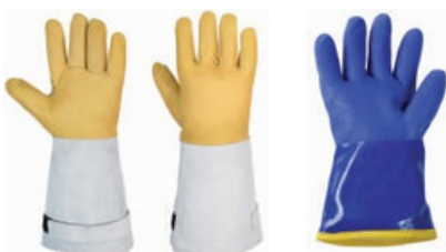
Cryogenic / Cold Resistant Gloves