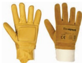
Anti Vibration Gloves