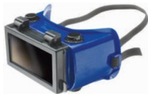
IR 11 - Welding Goggle