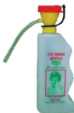
Eye Wash Bottle