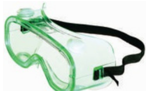
Clear Acetate - Chemical Splash