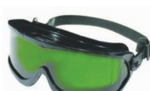
IR 5 - Welding Goggle