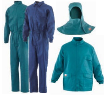
Flame Retardant Garment