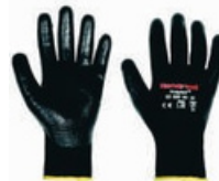
Seamless Knitted Gloves with Nitrile / PU / Latex Coating