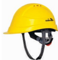
Karam PN 541/PN 542