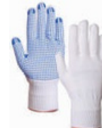
PVC Dotted Gloves: Cotton / Kevlar / Nylon