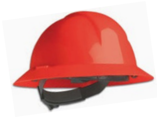
Full Brim Hat