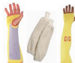
Kevlar / Cotton Arm Sleeves