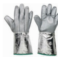
Heat Resistant Gloves up to 5000C: Leather / Cotton / Kevlar / Aluminized / Zetex