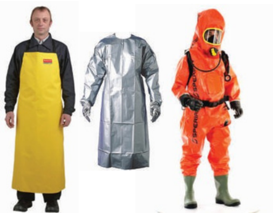
Chemical Aprons & Suits