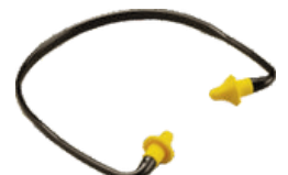
Banded Ear Plug