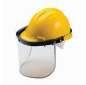
Clear Face Shield – Helmet Attachable