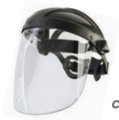
Clear Face shield

Visor Options : › Clear › Smoke Grey › IR Shade 5 / Shade 8 › Hi-Temp Gold Coated › Wire Mesh