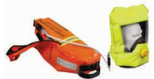
Emergency Escape Respirator