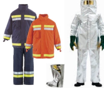
Nomex & Aluminized Fire Suits