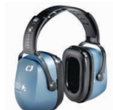
Clarity Ear Muff