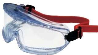
Clear - Chemical Splash