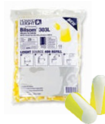
Uncorded Foam Ear Plug