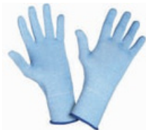
Cut Level 5 Gloves for Food Industry