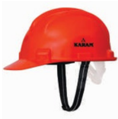
Karam PN 501/PN 521