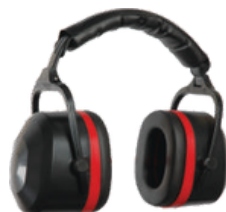
Ear Muff - High dB