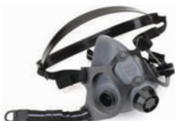
Full / Half Face Respirators – With cartridges & prefilters