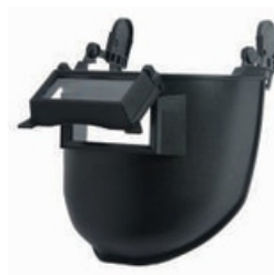
Welding Shield – Helmet Attachable