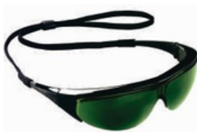
IR 3 Lens