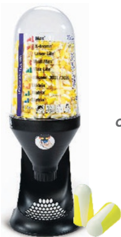
Ear Plug Dispenser

An extensive range of Disposable & Reusable (Corded / Uncorded) Ear Plugs, Banded Ear Plugs, Ear Muffs, Ear Plug Dispensers confirming to standards laid down by EN 352